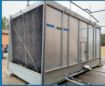
500 Ton Marley Model NC8307GS Series Cooling Tower