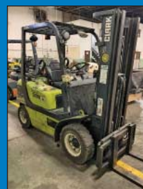
5,000 Lb. Clark Model G025L Solid Pneumatic Tire LP Gas Lift Truck