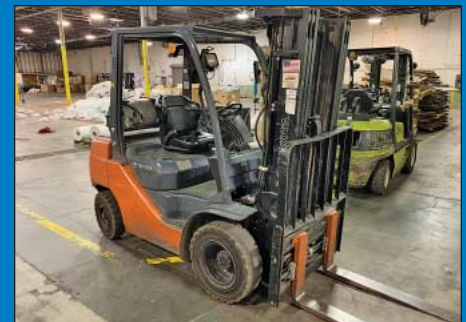
(2) 5,000 Lb. Toyota Model 8FGU25 Solid Pneumatic Tire LP Gas Lift Trucks