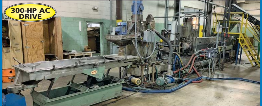
6" Davis Standard Model Thermatic Water Ring Pelletizing Line