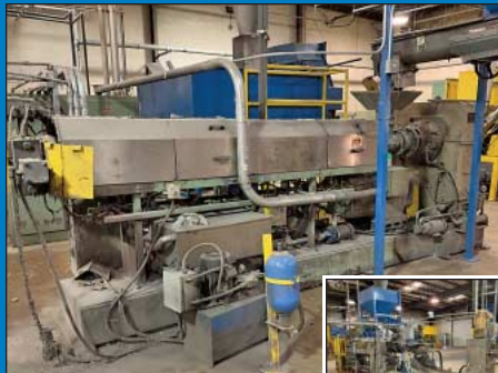
4.5" Crown NRM Pacemaker Water Ring Pelletizing Line