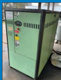
50-HP Sullair Model 3709A Rotary Screw Air Compressor