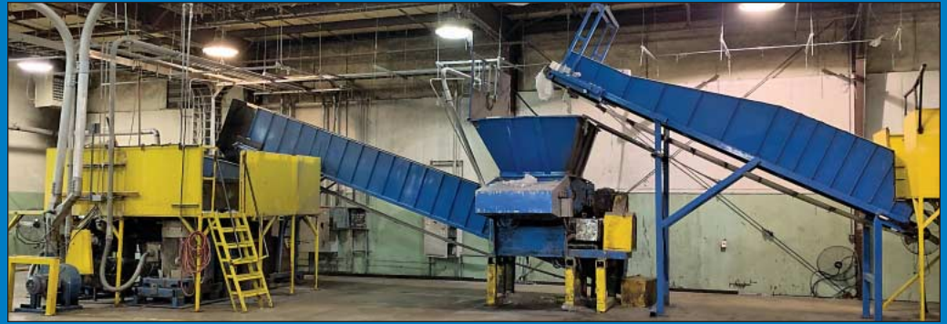
**150-HP Vecoplan RG52-FF and 250-HP Dual Tub Densifier Line