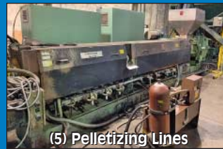
(5) Pelletizing Lines

Contact Information 2020 Dunlap St. Cincinnati, Ohio 45214 Phone 513-241-9701 Fax 513-241-6760 www.cia-auction.com