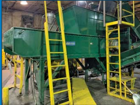
**200-HP SSI Model SR375H-RAM Single Shaft Hydraulic Shredder