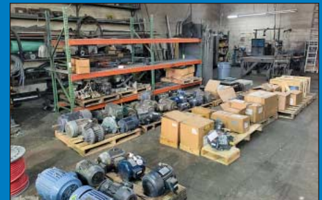
Maintenance Parts and Supplies