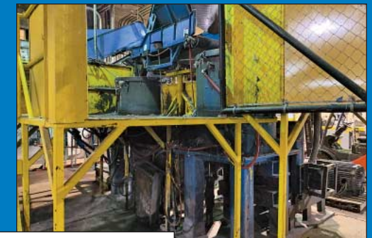
(3) 250-HP Dual-Tub Densifier Systems