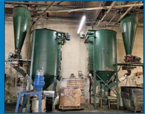
(2) 5' Dia. x 8' High Cone Bottom Blenders

100-HP Cumberland Model X-1000 Plastic Granulator; s/n 48100-99015, 20" x 40" Opening, Incline Conveyor, 15-HP Blower (New 2000)