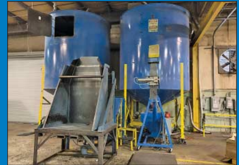
(2) 10' Dia. x 11' High Approx. Fabricated Steel Blenders