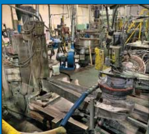
Berringer / Gala Water Ring Pelletizer