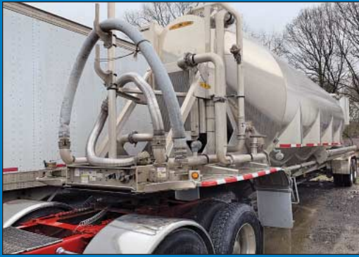
**2015 Heil Dry Bulk Tanker Trailer