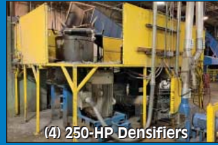
(4) 250-HP Densifiers