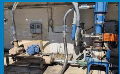
(5) Material Pumps to 50 HP