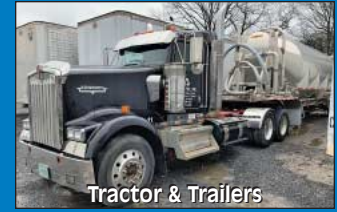
Tractor & Trailers