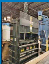
Galbreath Model VP2260HD-3060 Vertical Hydraulic Baler